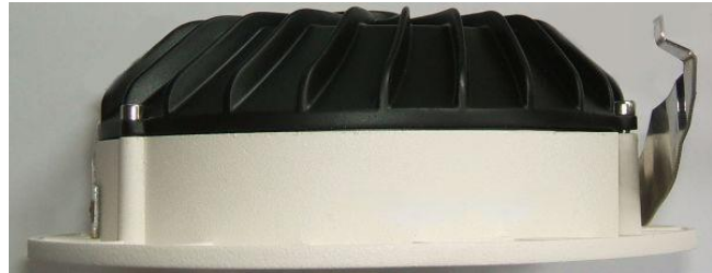
Cut-Out Ø 130 mm